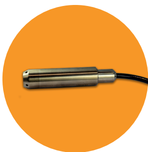
SmartDip Automatic Tank Gauging system