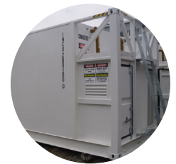
ON TANK APPLICATIONS